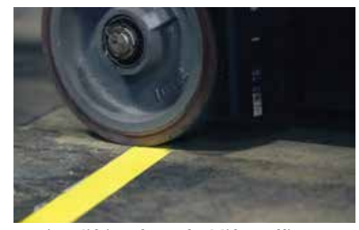
Resists lifting from forklift traffic.