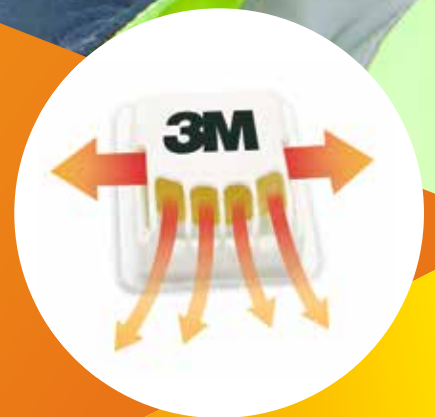
3M™ Cool Flow™ Valve

When working in hot and humid environments, finding both reliable and comfortable respiratory protection is key to helping keep workers safe. With 3M disposable respirators there's a solution: 3M™ Cool Flow™ Valve technology.