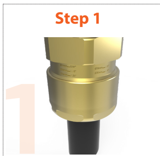
Follow cable gland installation instructions until final stage – tightening of rear seal

The gland is permanently marked with various lines/numbers indicating the correct tightening level related to the cable diameter. Following the relevant cable gland Installation Instructions, the back seal should be tightened until a seal is formed on the cable outer sheath and then tightened one further turn.