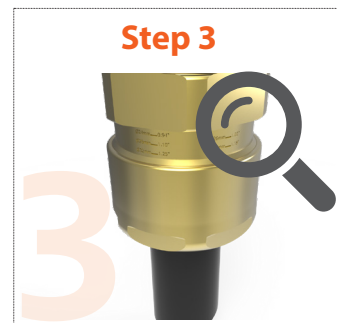
The backnut should be level with the marking guide corresponding to its diameter – this can be visually inspected and adjusted as necessary

Note: The cable gland installation instructions have a printed cable OD measure for if the cable OD is not known