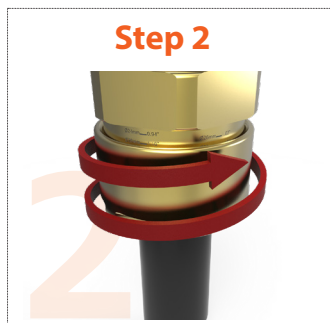
Tighten backnut until a seal is formed onto the cable, then tighten one further turn