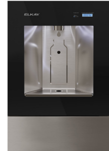
Unit with filter box dimensions:

Once installed, complete your fit and finish with drywall and paint.