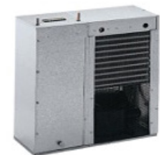
Remote chiller (ERS11Y)

Note: There are different chiller options available for commercial settings.